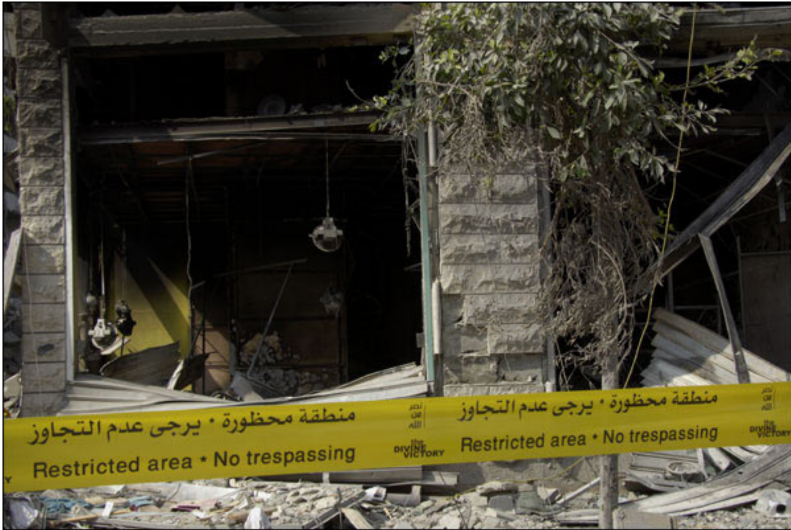
A consistent visual brand signature was applied on yellow police line tape.