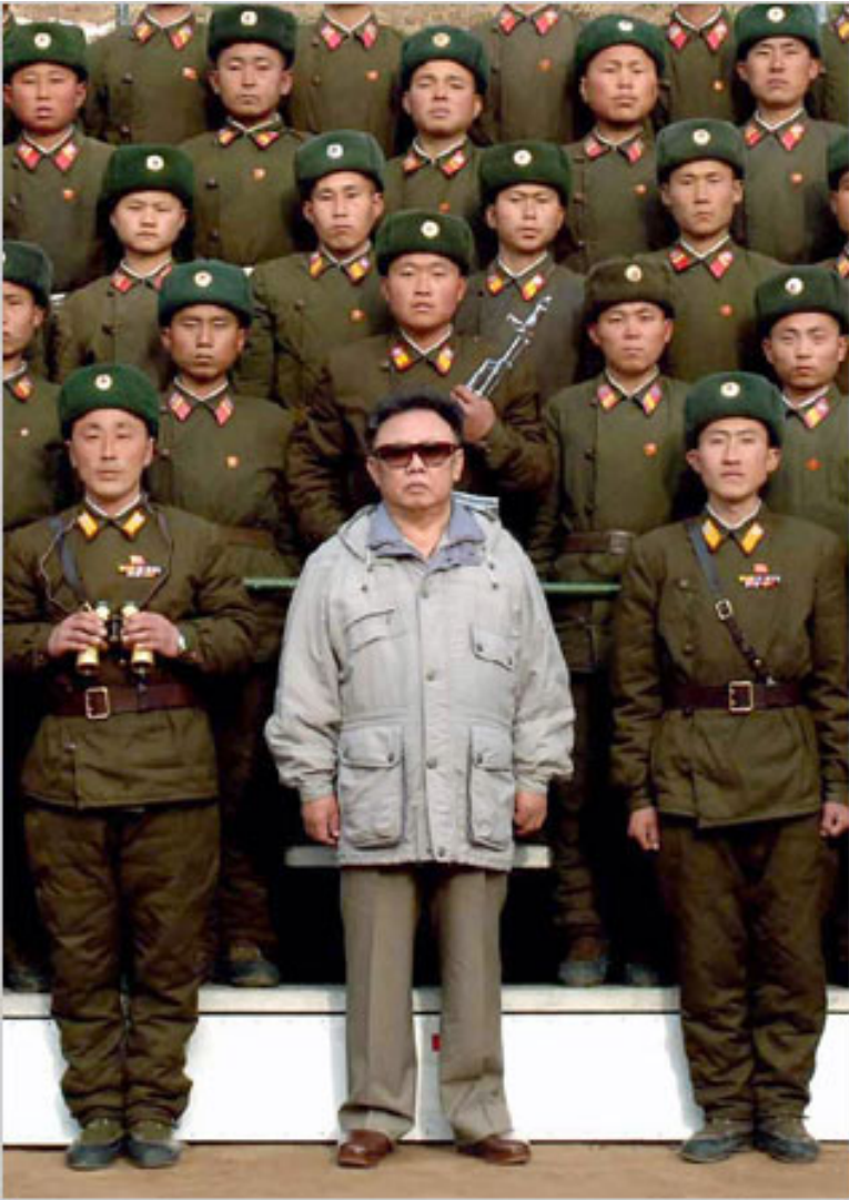
Kim Jong Il surrounds himself with soldiers, none taller than 5'3".