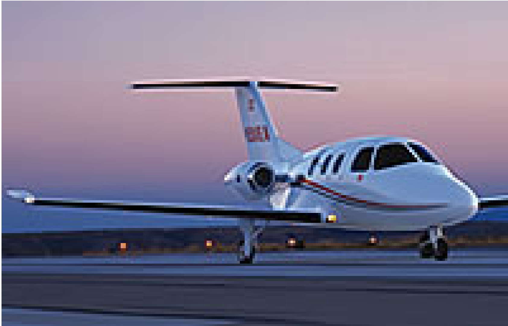
$1.2 million Eclipse 500 5-seater family jet