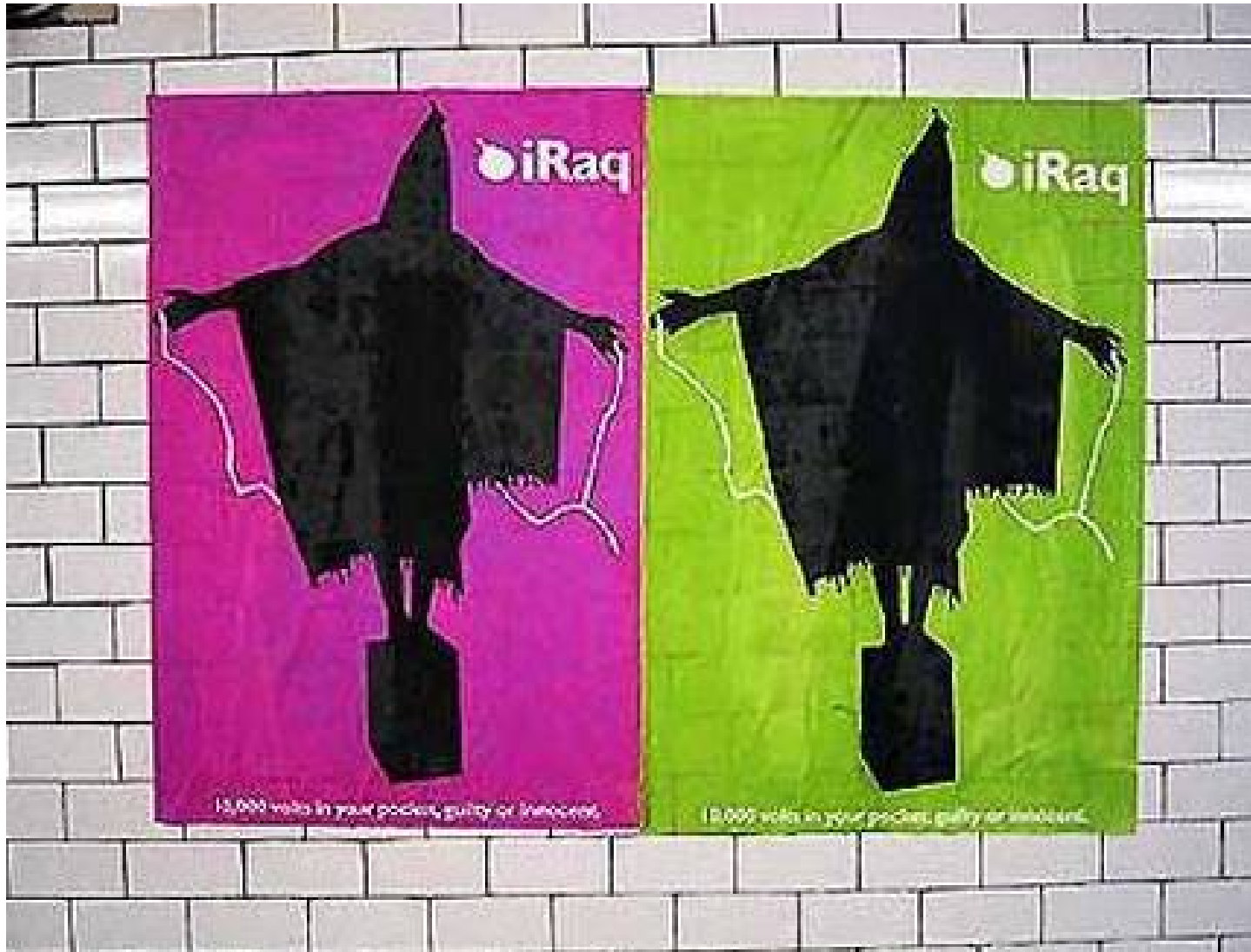
Posters hijacking the iPod brand campaign appeared in the London Underground.