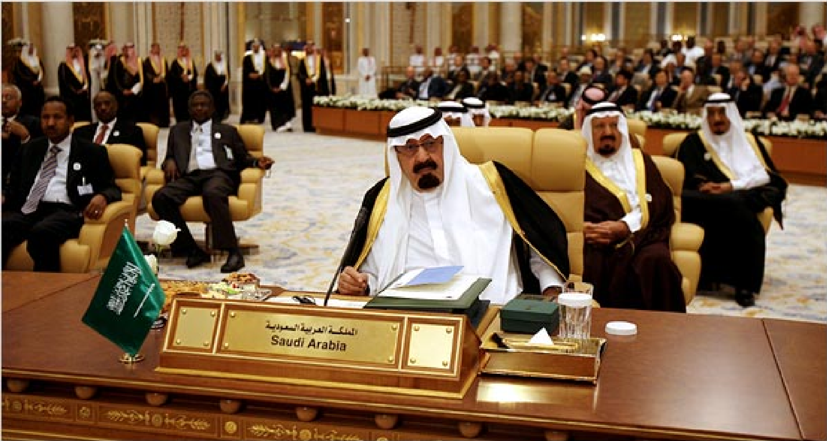
King Abdullah appears with 5 sheiks, identically attired.