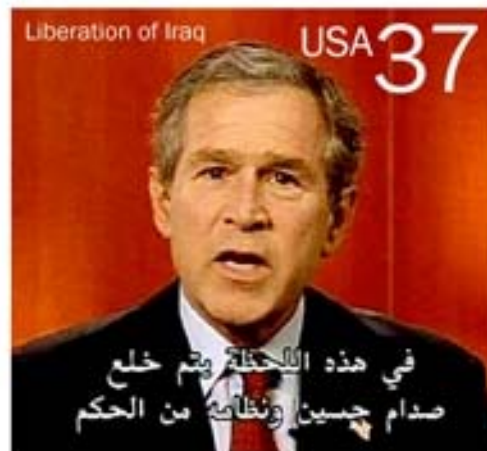
Satiric postage stamps created from news photos, protesting the Iraq war.